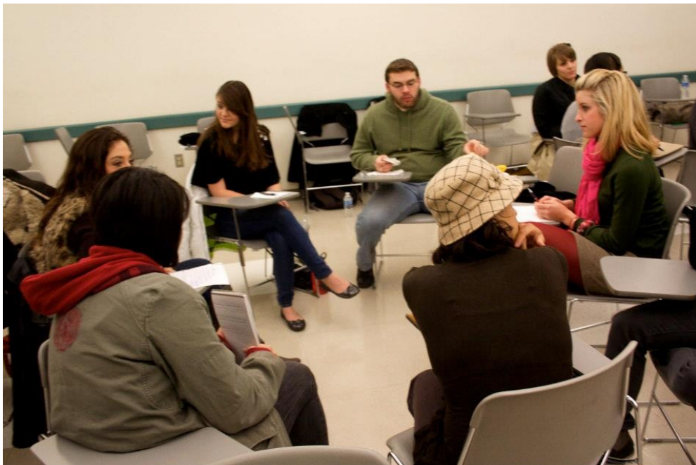
PLFs discuss student issues during Pre-Semester Training, Spring 2012